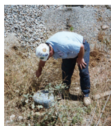
IRM finding an abandoned well during an onsite inspection.

Water is essential to life—and also to business. Whether manufacturing food or silicon chips, compacting cars or developing cosmetic lines, industries all over the world have discovered the benefits and risks associated with water entering and leaving company-owned facilities.