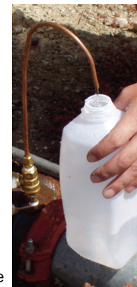
Taking a water sample from a client’s water system.

At IRM, we are committed to the safety and security of your water system.